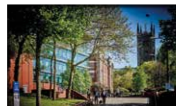
University of Wolverhampton

Embedded in the region's three major cities, we work with West Midlands Combined Authority (WMCA) and public and private sector partners, to achieve regional ambitions and deliver the local industrial strategy.