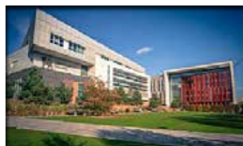
Birmingham City University